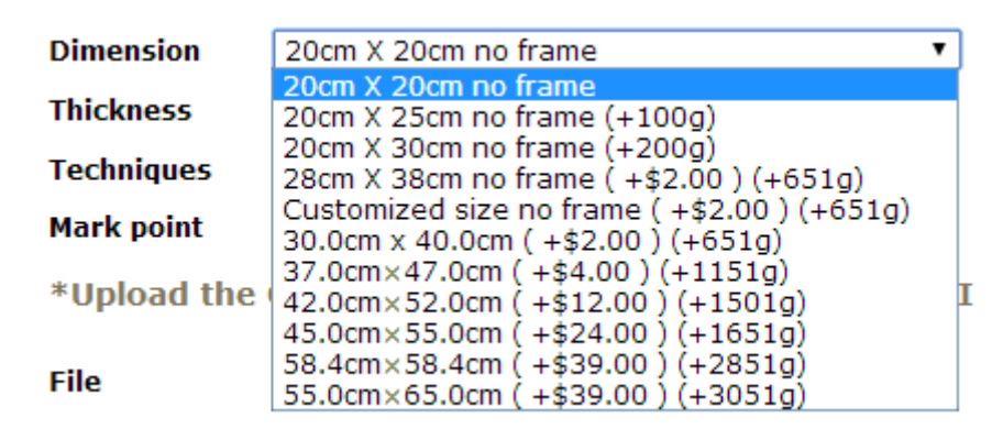
First, Choose the right Dimension of the stencil.